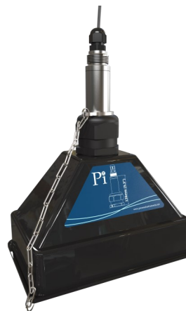
Optional light shield