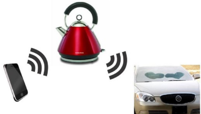
Internet of Things

And what does it matter? Well from Process Instruments' point of view, it doesn't. As long as our products are leading the way in providing our customers with what they need to enable their own Industry 4.0.