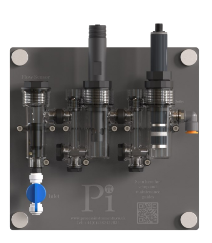
Double Open/Closed Flow Cell

4. Choose any flow cells or autoflushes that you might need for your sensors.