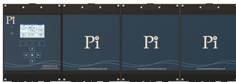
CRIUS® 4.0 with optional expansion boxes