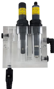
Double Open Flow Cell (OzoSense M and e.g. chlorite) PN:32100002