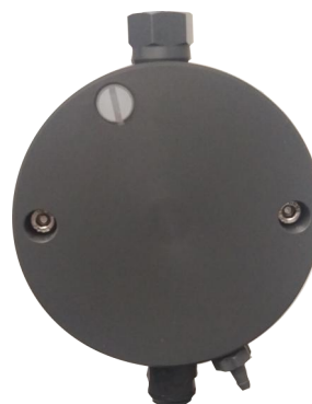
Flow Regulator (OzoSense NM) PN:37001304