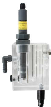
Single Open Flow Cell (OzoSense M) PN:32100001