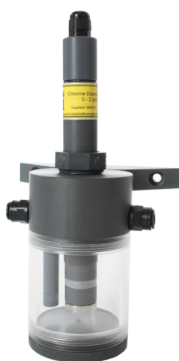
Single Closed Flow Cell (OzoSense M) PN:32100010