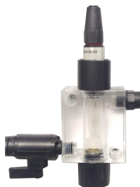
Single Closed Flow Cell (OzoSense NM) PN: 35003103