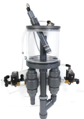
Autoflush Cell (OzoSense M) PN:36500001