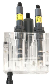
Triple Open Flow Cell (OzoSense M and e.g. chlorite and pH) PN:32100007